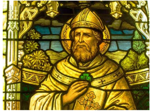
St. Patrick's Feast Day March 17

I arise today, through God's strength to pilot me, God's might to uphold me, God's wisdom to guide me. May the eye of God look before me, the ear of God hear me, the word of God speak for me. May the hand of God protect me, the way of God lie before me, the shield of God defend me, the host of God save me. May Christ shield me today. Christ with me, Christ before me, Christ behind me, Christ in me, Christ beneath me, Christ above me, Christ on my right, Christ on my left, Christ when I lie down, Christ when I sit, Christ when I stand, Christ in the heart of everyone who thinks of me, Christ in the mouth of everyone who speaks of me, Christ in every eye that sees me, Christ in every ear that hears me. Amen